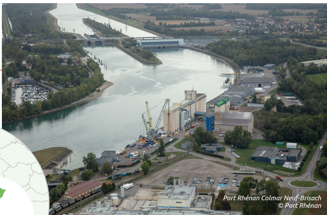
Port Rhénan Colmar Neuf-Brisach